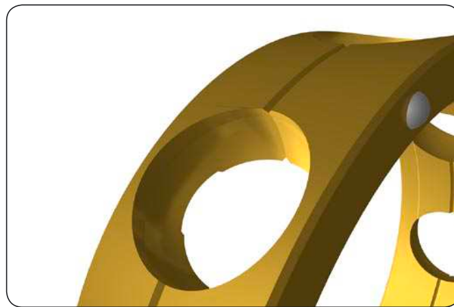
Detailed view of the newly redesigned M-cage pocket

For additional information, contact the SKF application engineering service.