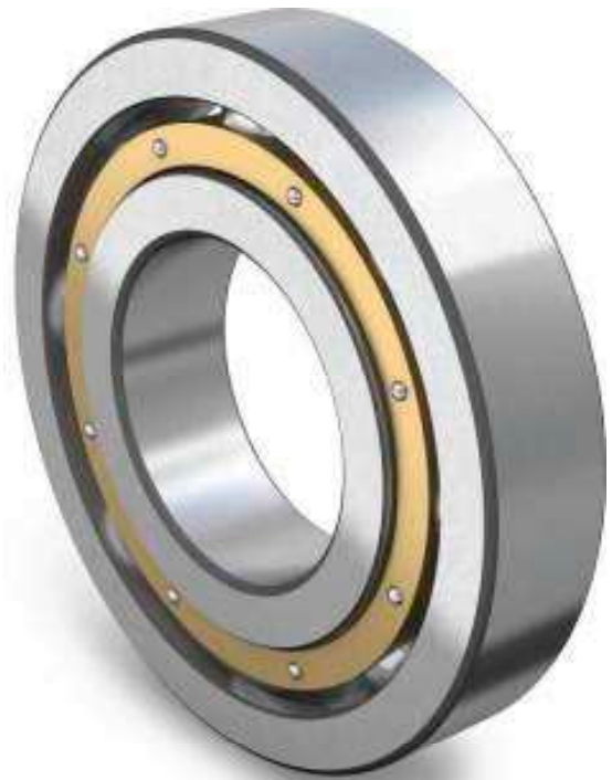
SKF deep groove ball bearing equipped with new brass M-cage